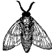
Figure 2: A sample black and white graphic that has been resized with the includegraphics command.